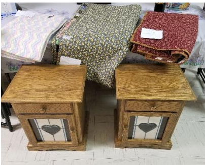
Hand-made quilts and end tables