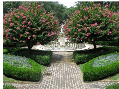
Reder Landscaping Gift Certificates!