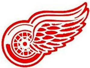
Red Wings Tickets!