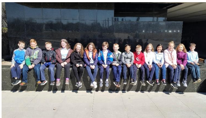
Our Fabulous 5 th Graders on Lansing field trip!