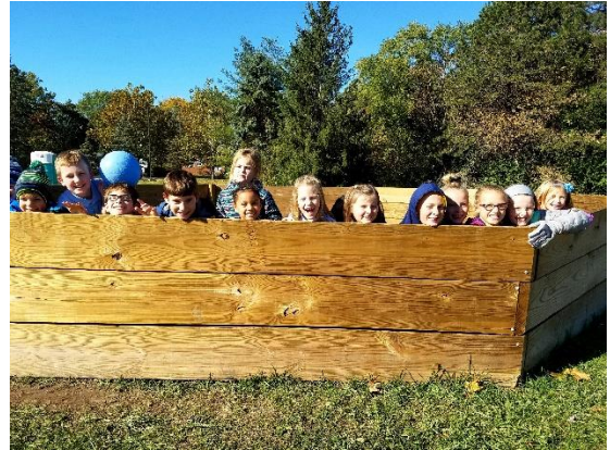
Happy Spring! It's Ga Ga Ball time again! Our kids love this playground game!