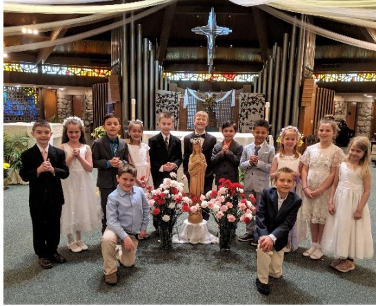
2 nd grade First Communion and May Crowning