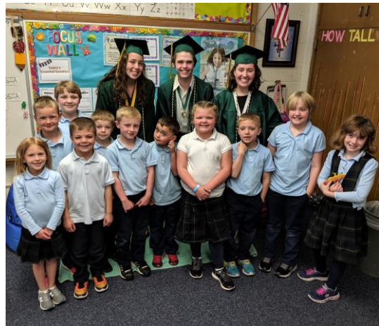
5 th and 1 st graders admired our previous students and graduates!