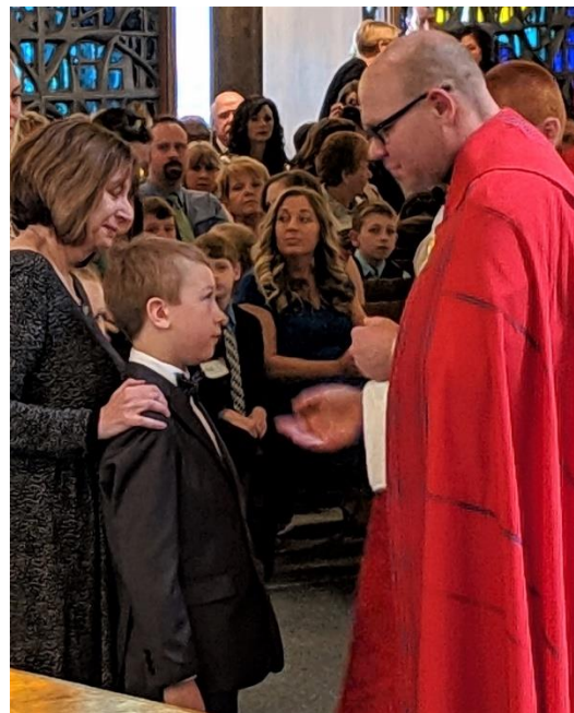
Grant is Confirmed!